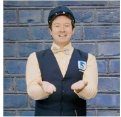
that he gave