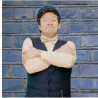
loved the world so much