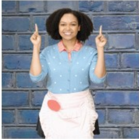
"Trust in the Lord